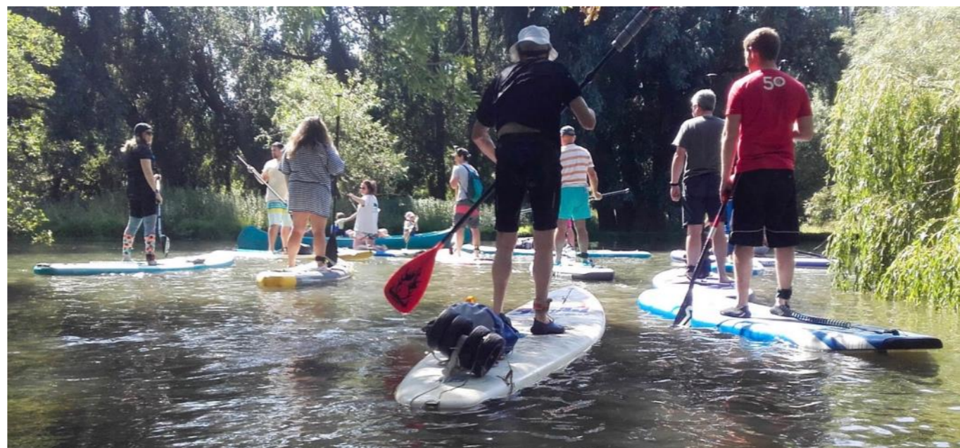
This is me with the windsurfer on The Cam, complete with portage wheels on the back of board