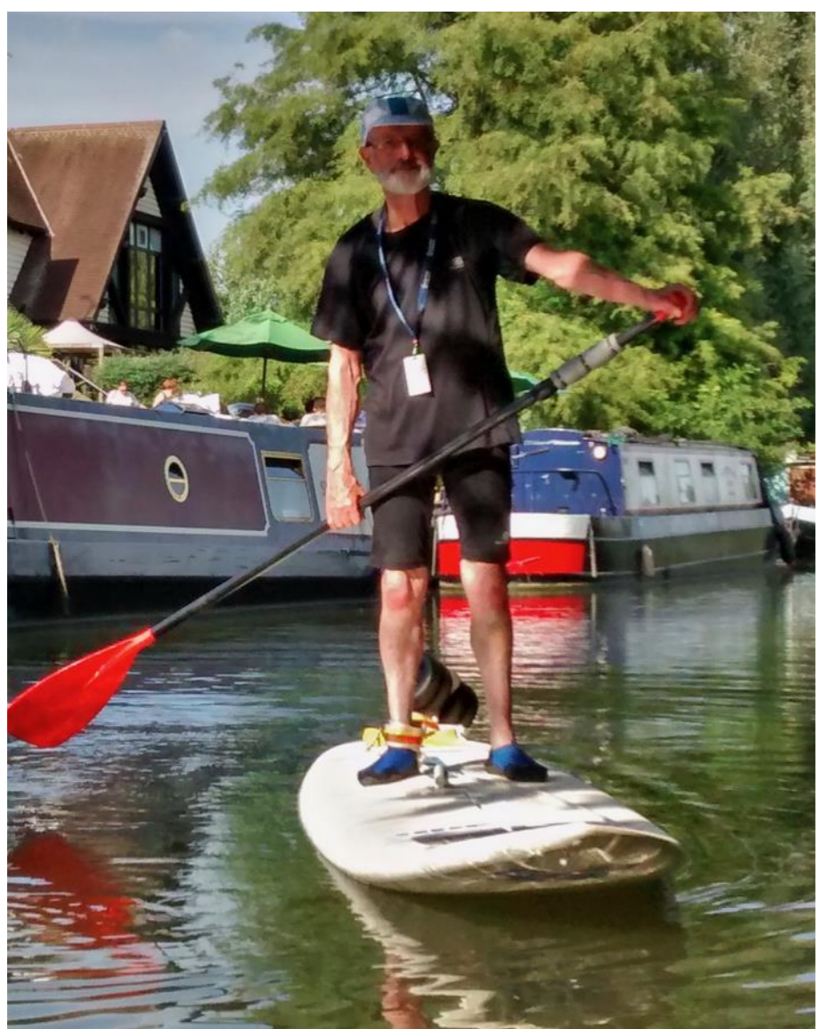
By the Moorhen in Harlow