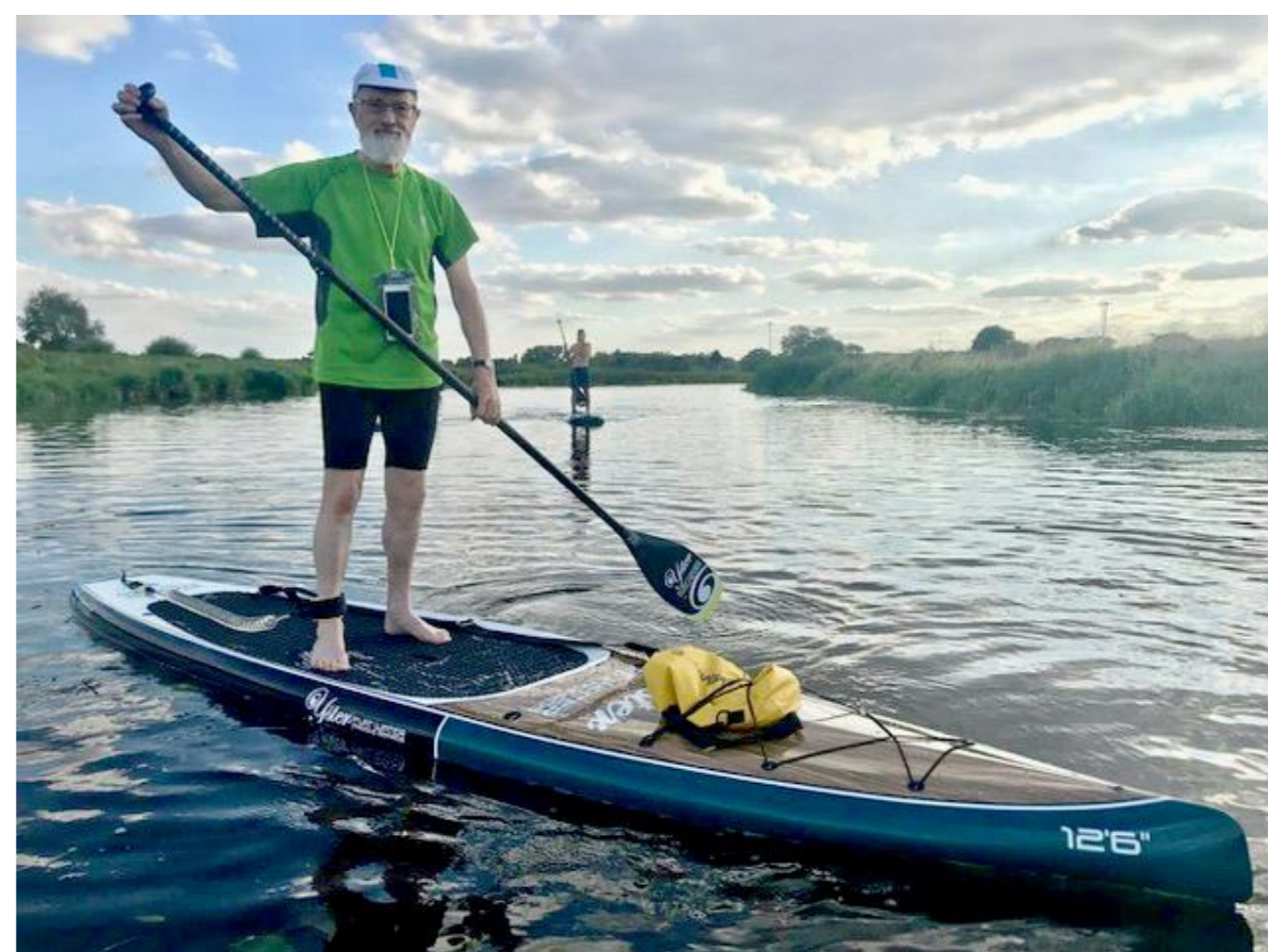
The new SUP on The Cam near Waterbeach.